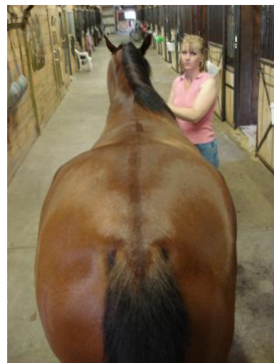
6/26 After 7 FES Treatments